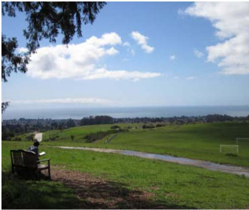
(Overlooking East Field. Photo courtesy of Laura Hartung)

Learn more about the UCSC Storm Water Management Program and UCSC Storm Water Management Plan at cleanwater.ucsc.edu